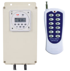
RGBC Controller with Remote Control