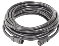
LKC - 5 Pin Quick Connect Power Cable (15' or 30')