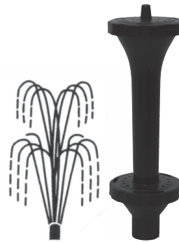
Double Volcano 7 1 / 2 " tall EFN4