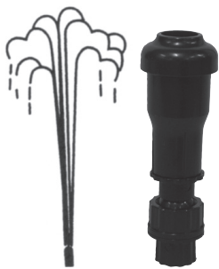
Foam Jet Swivel base, 5 3 / 4 " tall EFN1