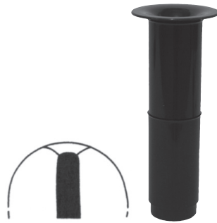
Water Bell 6 1 / 2 " tall EFN2