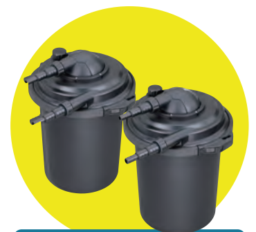
EC1300 / EC1300U for ponds up to 1300 gallons