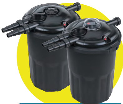
EC3900 / EC3900U for ponds up to 3900 gallons