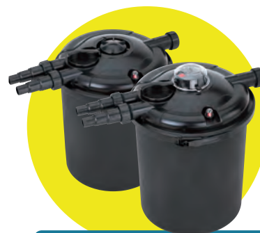
EC2600 / EC2600U for ponds up to 2600 gallons