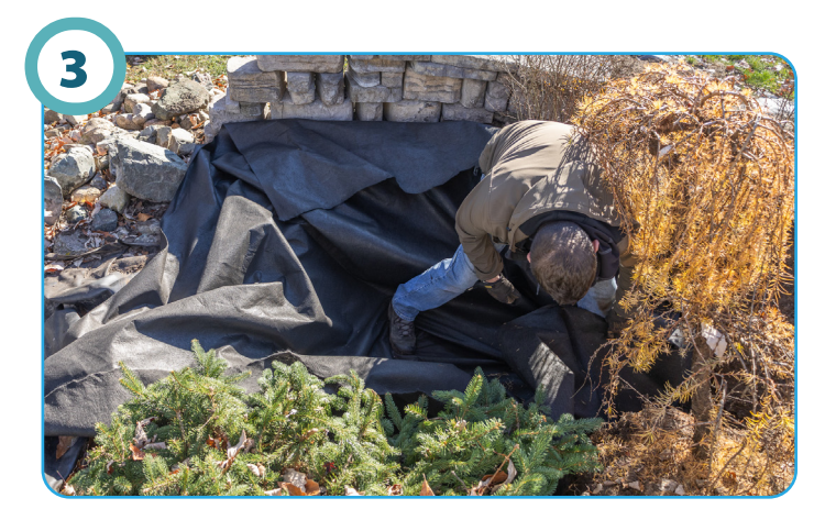
Install the underlayment in the excavated area. Tuck underlayment into the trench.

Excavate the area based on the above dimensions. Add a 6" x 6" x 6" deep trench for the diffuser pipe. Orient trench for incoming water and backflush lines. It is ok to over size length & width of your excavation