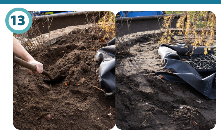
Dig an anchor trench around the top of the filter. Tuck the liner into the trench, back fill and compact the soil to hold the liner in place.