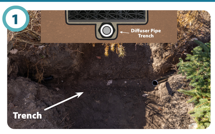
EBK1: 4' x 3' x 3 EBK2: 4' x 6' x 3'

Excavate the area based on the above dimensions. Add a 6" x 6" x 6" deep trench for the diffuser pipe. Orient trench for incoming water and backflush lines. It is ok to over size length & width of your excavation