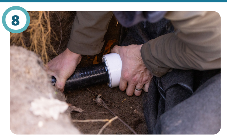
If using 2" plumbing, install the 3" x 2" reducer bushing into the 3" male adapter. Install and glue your supply line and waste line into the male adapters/reducer bushing. *If not being connected to a backflush line, install a cap or plug (sourced locally) into the second male adapter.