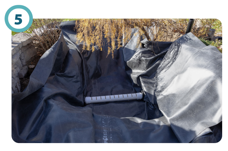
Unfold the liner in the excavated area, tucking the pipe into the trench.