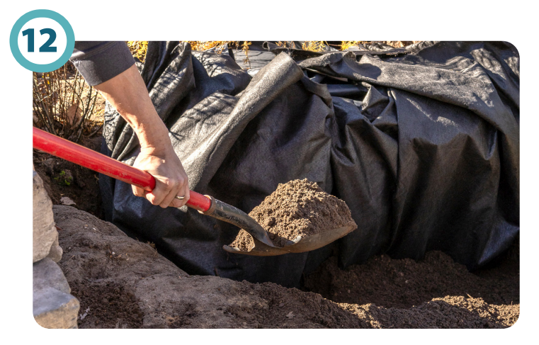
Lay the extra liner and underlayment around and over the cubes. Backfill around the cubes until they are snug in place.