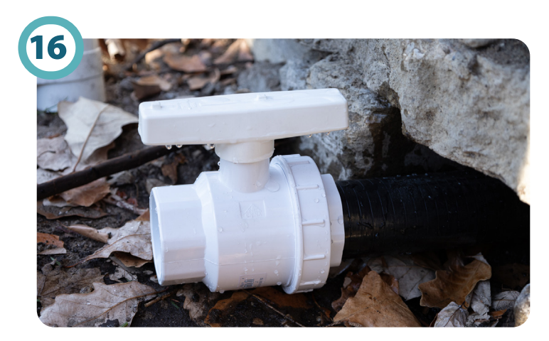
(Optional) Connect the union ball valve to your backflush line. *This valve can be installed in a valve box if it is being installed below grade

Finishing adding gravel, decorative boulders & landscaping