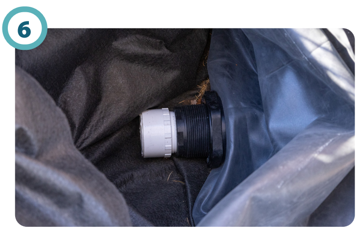
Pull back liner to expose the bulkhead/male adapter. Confirm that the bulkheads are tight/securely attached to the liner.

*Only applies if you intend on using the back flush valve