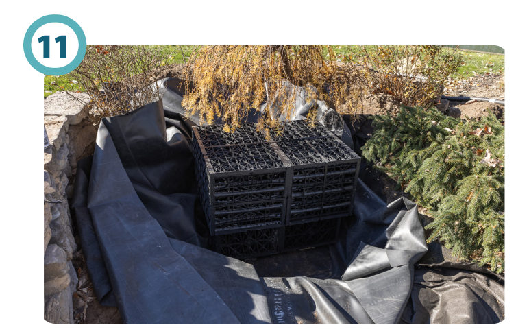
Install Eco-Bog Cubes on top of the HSC22 Cubes.