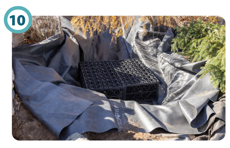
Assemble and install HSC22 cubes over the diffuser pipe.