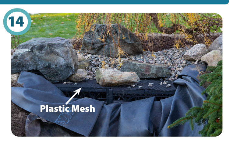
Install plastic mesh over the Eco-Bog cubes. Begin covering the system with gravel and decorative boulders.