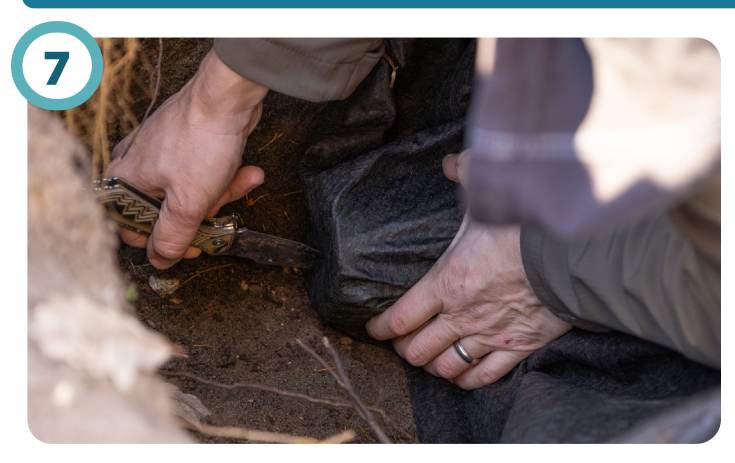
Stretch underlayment over the bulkheads/male adapters. Cut an X in the underlayment to allow it to be pulled over the male adapters & bulkheads