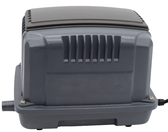
KPA60 / KPA80