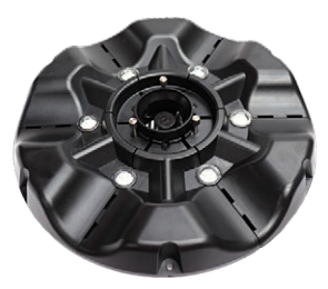
1 Fountain Float with 6 Built-In LED Lights and 30' Cord