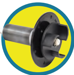
Durable Ceramic Impeller