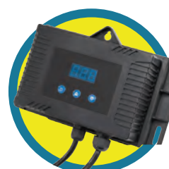
Flow Control (EPS4900VF Model)