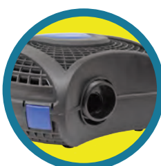
2" Outlet for Higher Flows