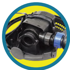
Permanent Magnet Motor