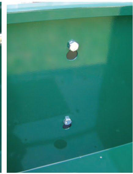
6. Tighten lag screws inside the cabinet. Second person may be needed to support cabinet during this step.

Cabinet is now installed. Follow aeration kit instructions to properly install compressor, tubing and diffusers.