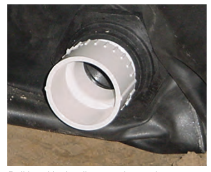
Bulkhead is thru liner, washer and nut are tightened and PVC adapter is installed.