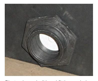
Photo shows bulkhead fitting and plug installed in the end of the spillway.

Once you have sculpted the reservoir, stream and waterfall area carefully check for any rocks, roots or sharp objects in the soil. After ensuring the area is free from objects you can install the underlayment thru the reservoir and stream area. After installing the underlayment you can install the liner as well. Do not be concerned with a few wrinkles in the liner since the whole area will be filled in with rock and covered. Be sure to pull any extra liner towards the waterfall area.