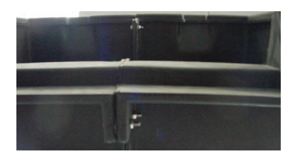
The two long bolts are used on outside of the spillway on the bottom side of lip.

If your spillway comes unassembled you will begin by bolting the sections together with the stainless bolts included. Before assembling the pieces apply a large bead of silicone caulk to one of the pieces (as shown). Slide the pieces together so the flat surfaces match up, use the stainless bolts and washers from one side and the nut with a built in star washer from the other side. Install all the bolts before tightening any of them.