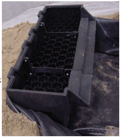
The liner goes under the spillway and wraps up the back and ends.