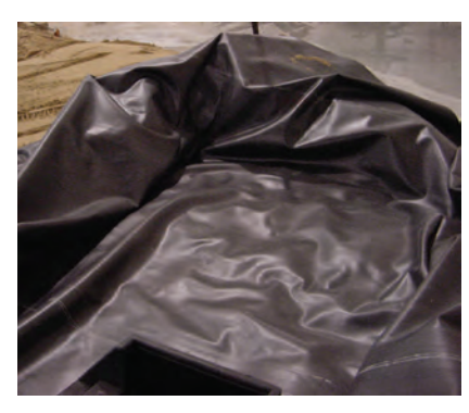
The liner covers the stream bed and goes thru the area where the spillway will set.

The spillway can be covered in rock to help hide it from view. Place 3" to 6" rocks on the plastic grating as desired to camouflage all plastic from view. This will help your installation look much more natural.