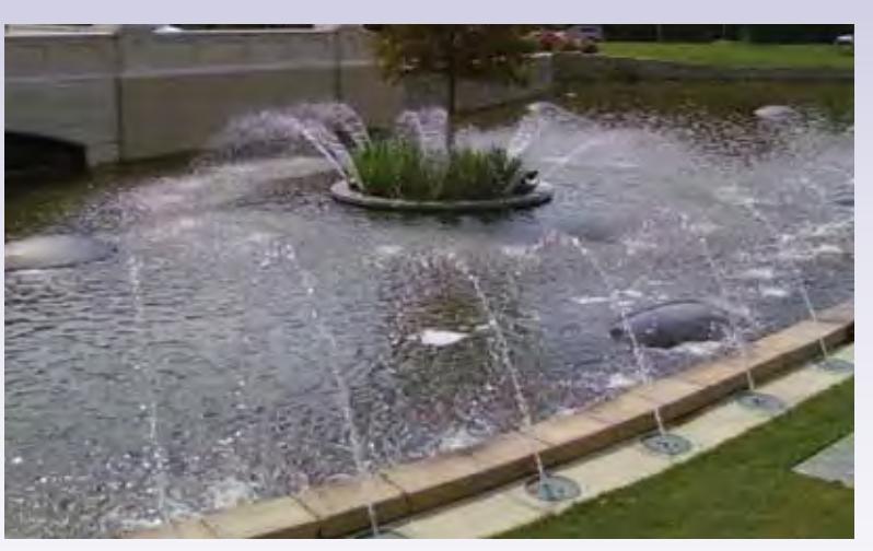
Liner "whale backs" can result from accumulated ground water, air bubbles or a combination of the two. This occurs when there is no venting or drainage installed below the liner.

Nearly every pond builder has likely encountered a pond where the liner floated up off the bottom due to excess water or air buildup under the liner. Areas where the soil is high in organic matter tend to give off excess methane gas while other areas have a high water table, especially after large rain events. Both of these can cause the liner to float part way to the surface, all the way to the surface or in extreme cases the liner will float above the surface creating what are commonly called "whale backs" (see photo). Previously the only way to vent this water or air from under