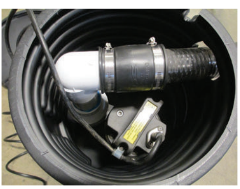
Do not overtighten discharge assembly while installing pump into vault.