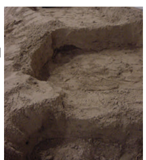
Sculpt and compact dirt in stream area before installing liner