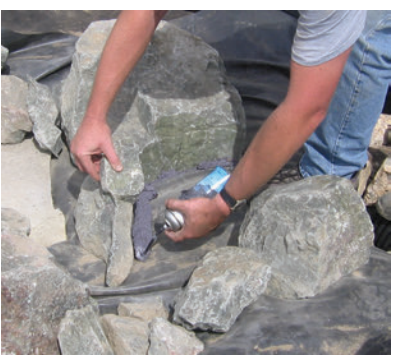
Use expanding foam to fill in voids between rocks

Once you have placed all the large rocks, you can use EasyPro Black Waterfall Foam to fill in any voids between the rocks. This will keep the water from going under or in between them and make it go over the rocks so you can enjoy the flow. You do not need to foam every rock in the stream, about every 4' - 5' in the stream do a section. Also foam any areas where the water makes a vertical drop.