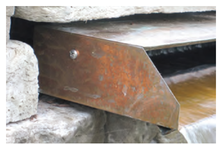
Figure 4 - Screw Placement