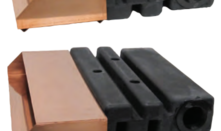
Figure 2 Incorrect Assembly