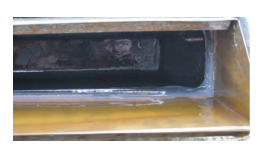
Figure 5 - Silicone Application