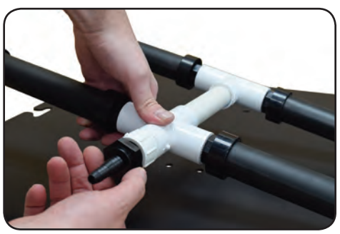
3. Install barbed fitting into manifold assembly. Select fitting based on tubing size being used.