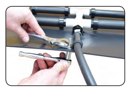
7. Attach strain relief fitting to the underlay plate. Use 17.5mm clamp for 3/8" tubing or 25.5mm clamp for 1/2" and 5/8" tubing.