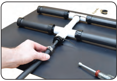
5. Slip hose clamp over the end of the tubing and push tubing onto the fitting.