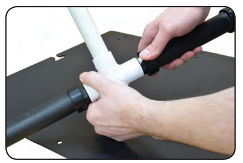
1. Assemble 6" rubber membrane weighted diffusers to the manifold. Snug by hand only. DO NOT OVERTIGHTEN!

Units may vary in appearance, assembly is the same