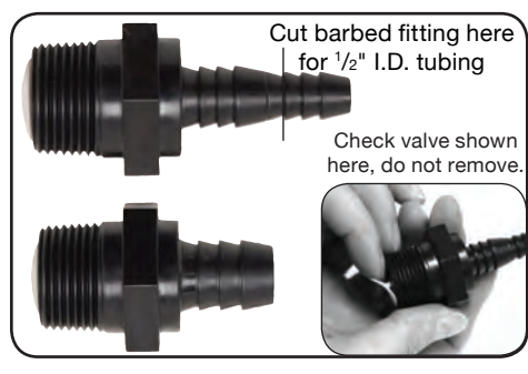
2. <sup>3</sup>/<sub>4</sub>" MPT barbed check valve is designed to be used with 1/2" or 3/8" I.D. tubing. Use larger barbed fitting for 5/8" ID tubing